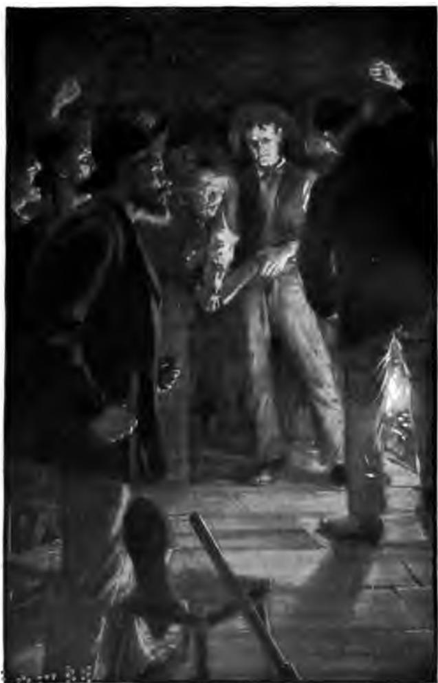
The scratch of the point on the hard steel.